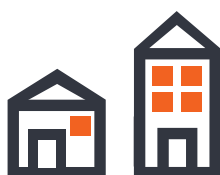
House or townhouse