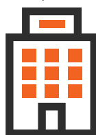
Apartment building (3 storeys or less)